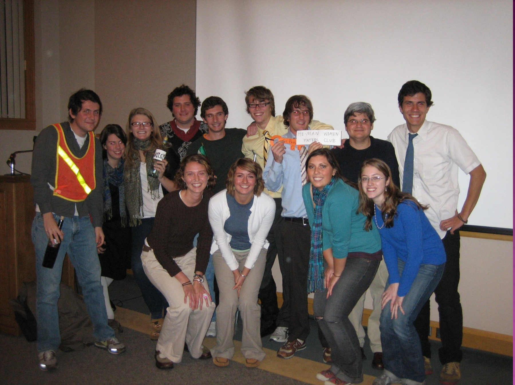
The award-winning cast!