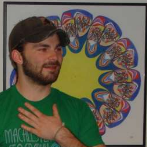
DESCRIPTION: [Illegible text]