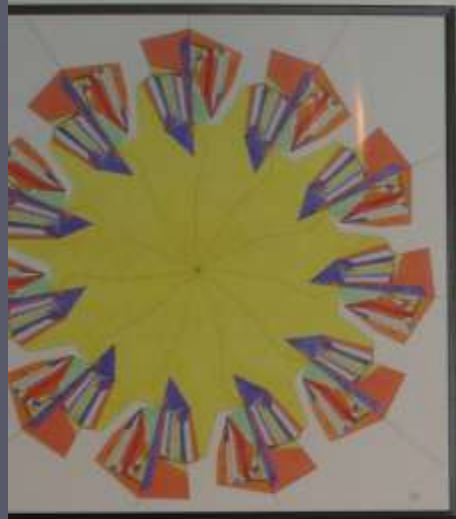
DESCRIPTION: [Illegible text]