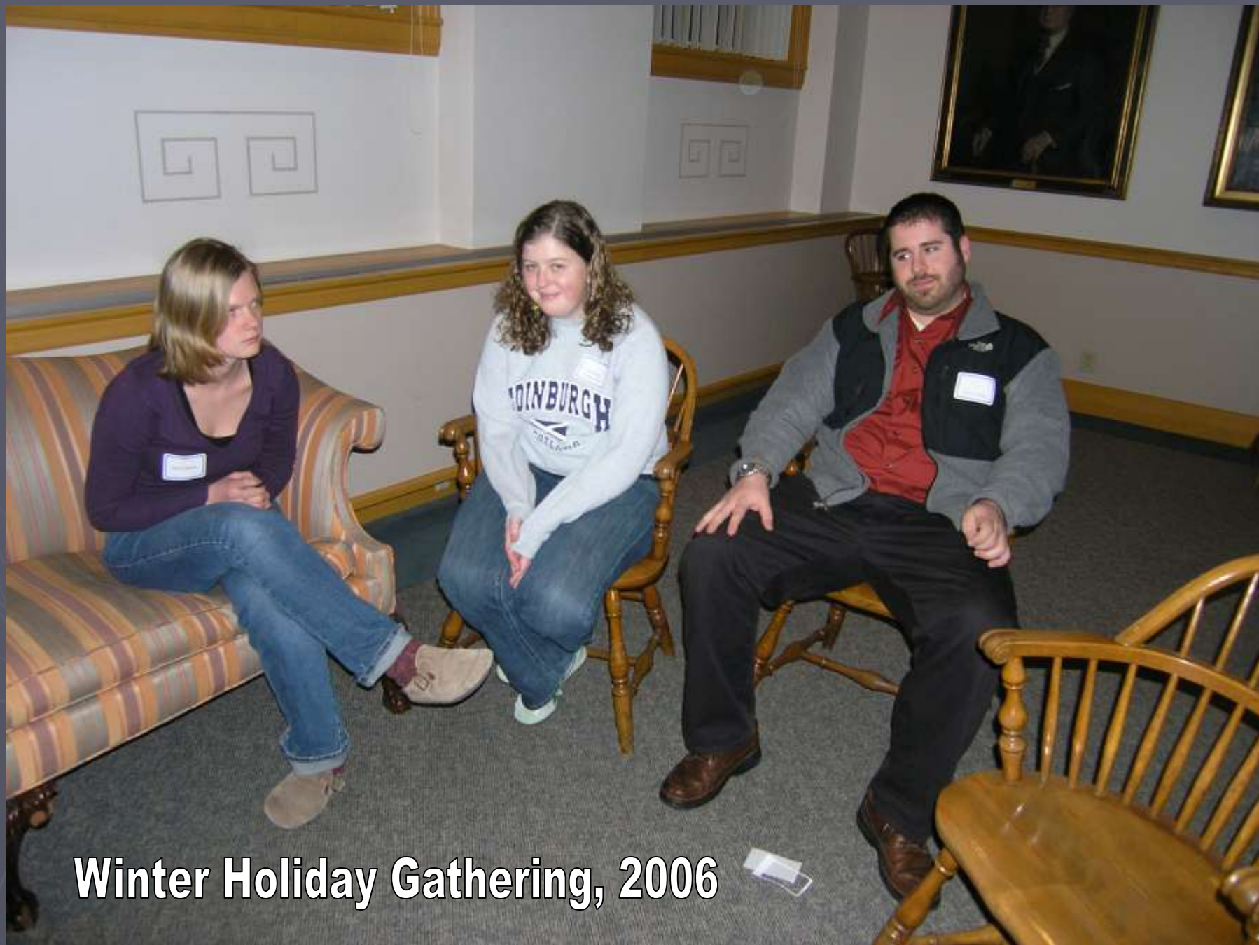
Winter Holiday Gathering, 2006