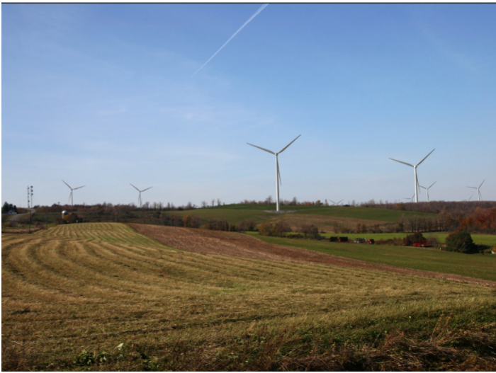
Simulation of view from “from County Route 18 at the intersection of County Route 116 looking northwest” (EDR)

and negatively effecting tourism. Otsego2000 an organization founded to (successfully) resist a powerline project and a public boat launch in the area applied the same rhetoric to the wind farm. The monks of the Holy Trinity Monastery were also vehemently opposed to the project. An organization called Advocates for Stark was also vocal against the turbines. The Preservation League of New York State listed Holy Trinity as one of the state’s seven “most-threatened historic resources.”