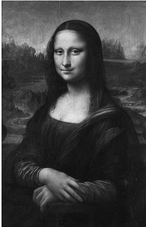
Figure 14.9. The Mona Lisa, also called La Gioconda , painted by Leonardo da Vinci around 1503–1505.

The Mona Lisa, displayed in black and white in Figure 14.9 has a distinct yellowish cast. Even the sky and the river coursing through the background are yellow. Since the painting is 500 years old, it’s reasonable to expect that some colors of the paint have faded and the that the varnish has yellowed. Also, the colors may have been altered in the process of photographing and reproducing the image. Can we correct the colors to show what the original painting may have looked like?