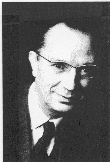
Pierre Jacquinot published his initial paper on this topic in 1954. J. Optical Society of America 40, 761-765.