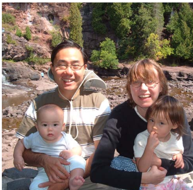
At Gooseberry Falls on the North Shore of Lake Superior, August 2007