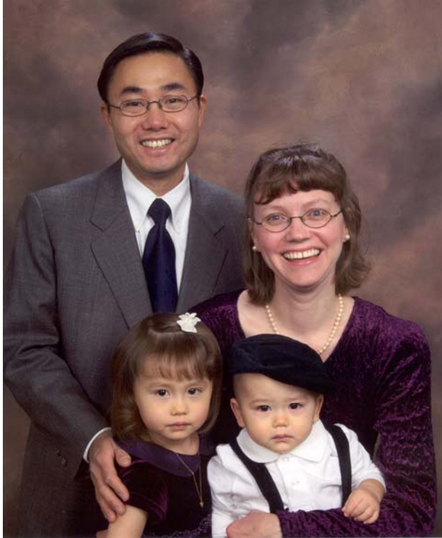
The family in November 2007