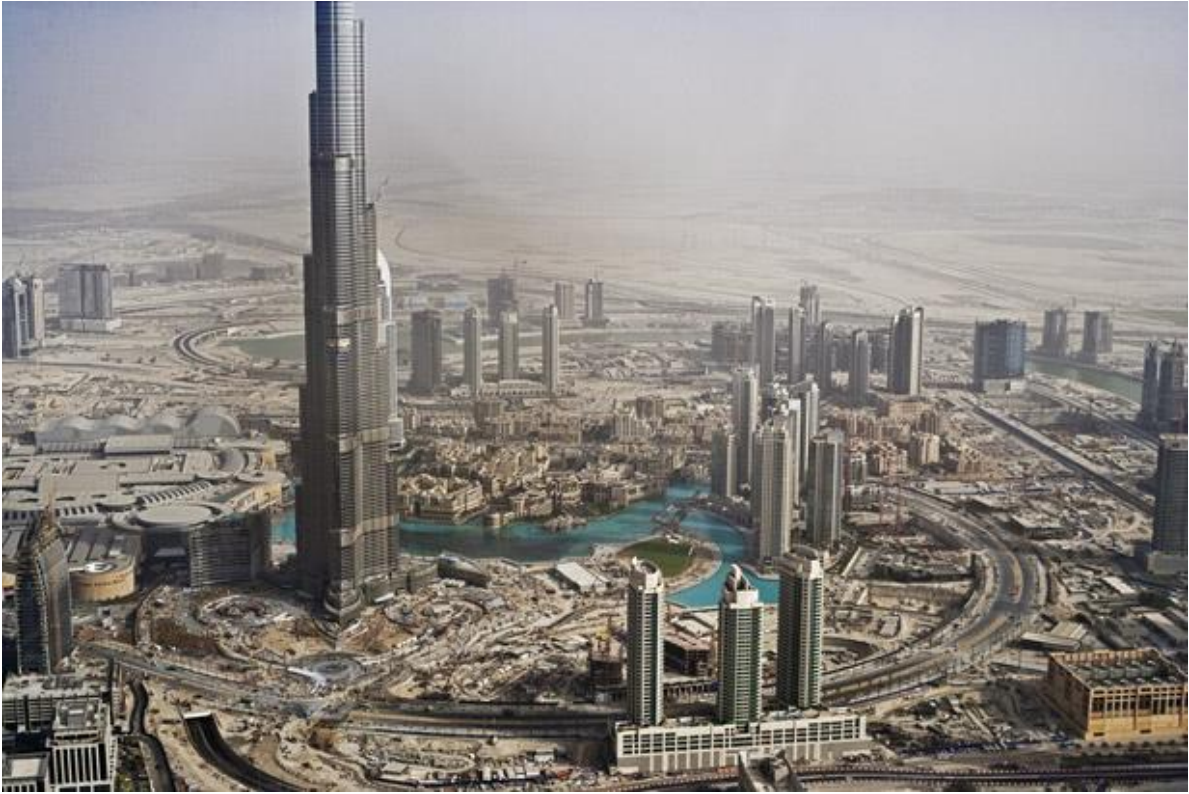
Image Credit: E. Kolbert "Enter the Anthropocene-Age of Man" March 2011