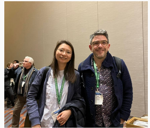
Lots of familiar faces at the 2023 AAG Conference in Denver, Colorado.