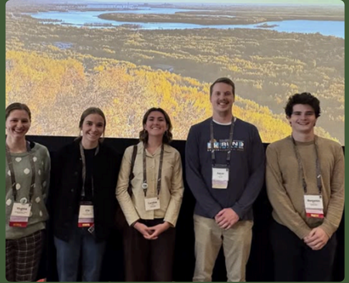
Mac Geography sent a delegation to the MN GIS/LIS Conference in Duluth.