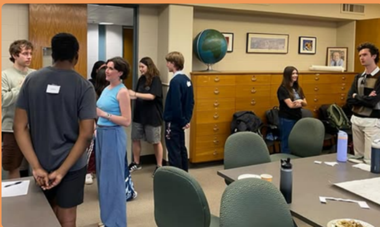
This year, UMN Geography hosted Mac geographers at the third annual UMN x Macalester Geography social. Hope to see them again soon!