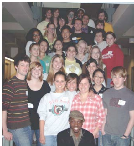
Class of 2009 at Spring Dinner