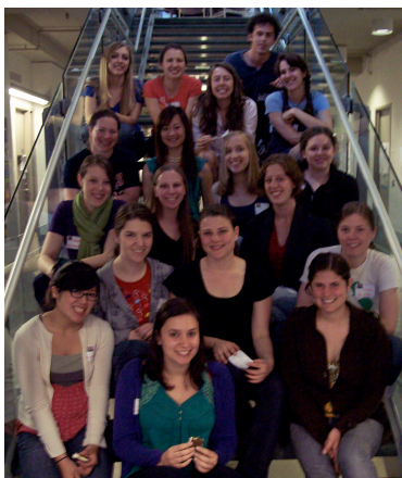
Class of 2010 at Spring Dinner