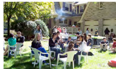
Past Fall Picnic

Thursday, September 16 th . Hope to see you there.