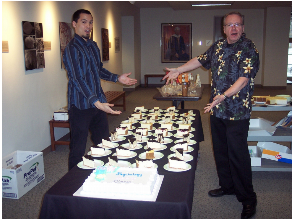
The Seventh Annual Spring Dinner was held on Monday, April 15th. This has now become an annual tradition where we honor students receiving awards, honors students and graduates. The food (Italian from Carmelo's) was delicious and plentiful. The Psych Trivia Challenge was also great fun!