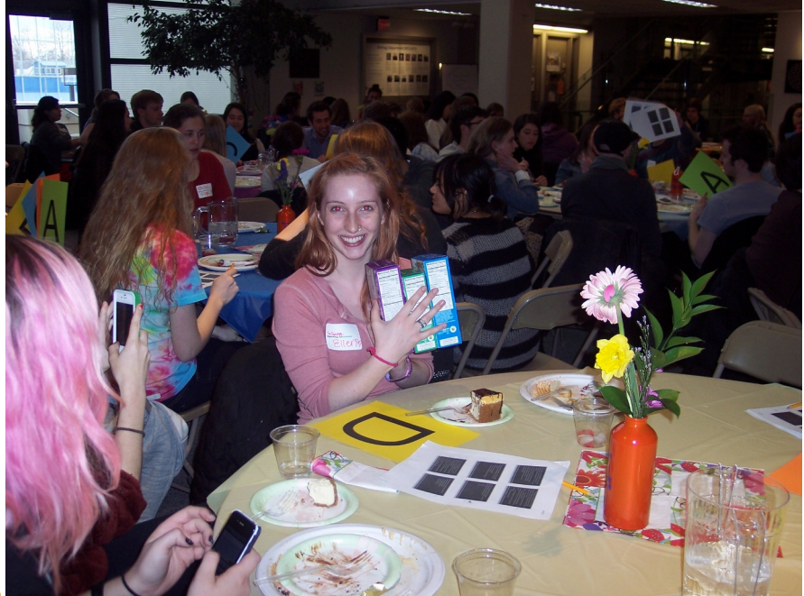
Spring Dinner shots