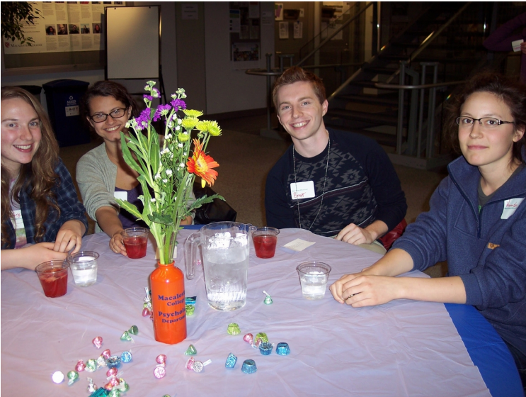
Spring Dinner -