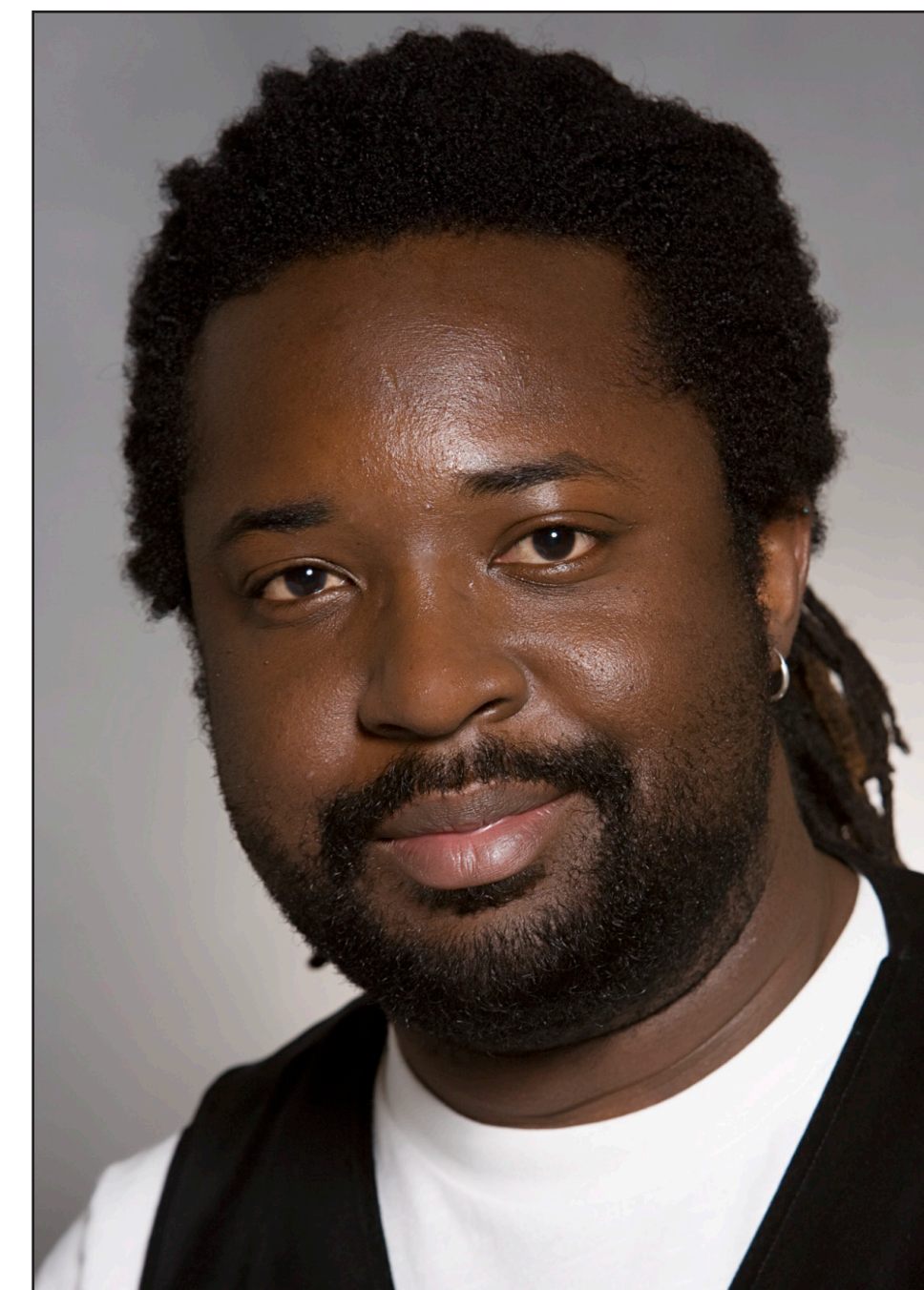
Marlon James English BA University of The West Indies MA Wilkes University Creative writing